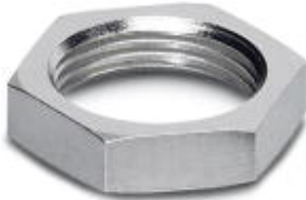
Flat nut with M8 thread

Please be informed that the data shown in this PDF Document is generated from our Online Catalog. Please find the complete data in the user's documentation. Our General Terms of Use for Downloads are valid ( http://download.phoenixcontact.com )